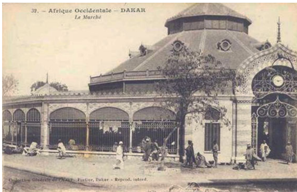
Postcard showing Marché Kermel in the 1910s, Dakar, Senegal.