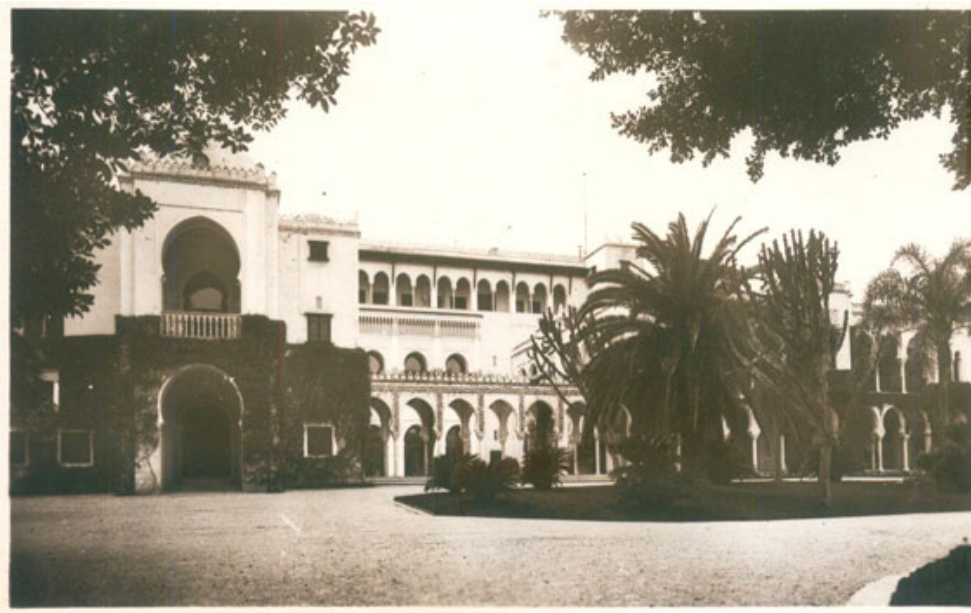
Postcard showing neo-Moorish colonial architecture in Algiers (the reconstructed Palais du Gouverneur, 1913).