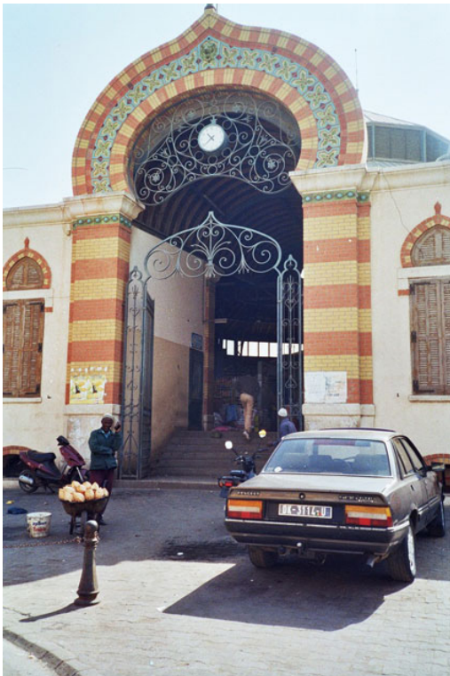
One of Kermel’s three entrance portals.