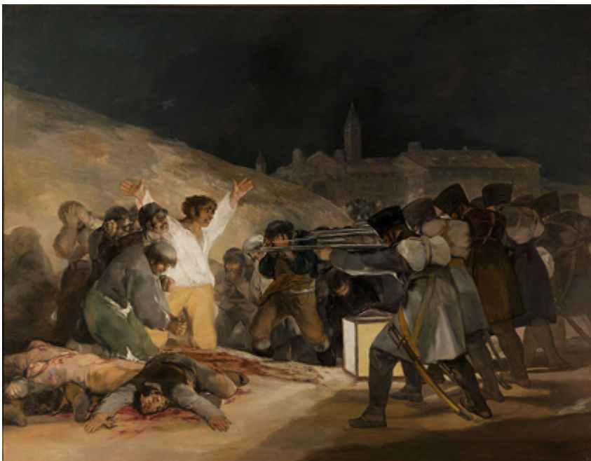
Goya, The third of May 1808 , (1815-16).