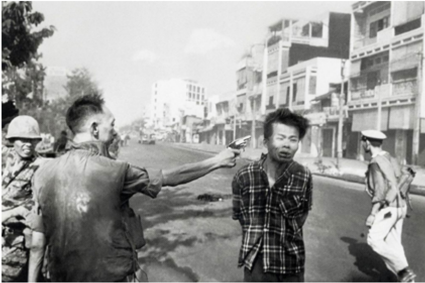
Eddie Adams, An execution of a Vietcong prisoner 1968.